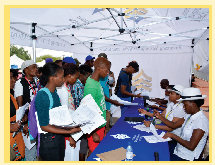
Corporate Communications Division staff with Certification Division helping students with certification of results statements and certificate