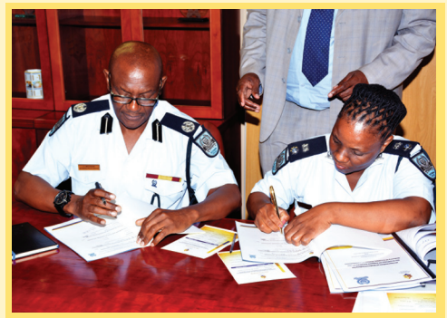
Botswana Police Legal officers signing the MOU at \ensuremath{\mathsf{REC}}