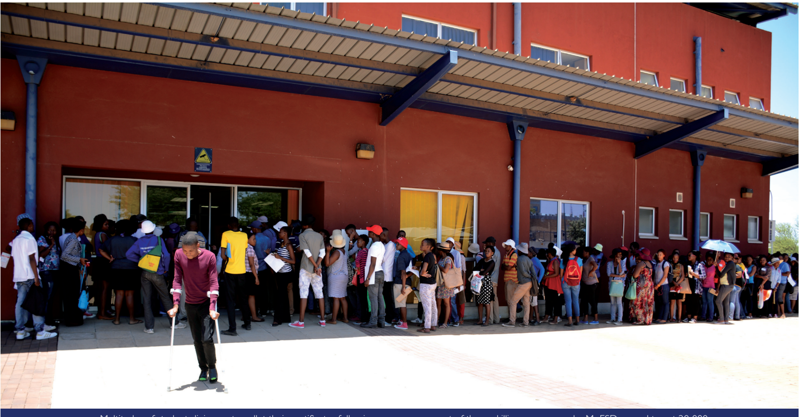
Multitudes of students lining up to collet their certificates following an announcement of the upskilling programme by MoESD named target 20 000.