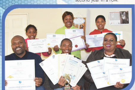
Lefika's family cannot wait to display yet another accolade